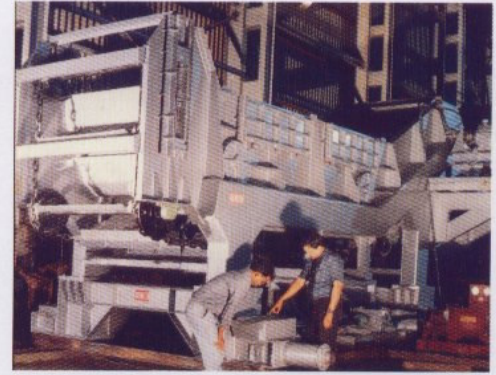
SCRAPER CHAIN CONVEYORS